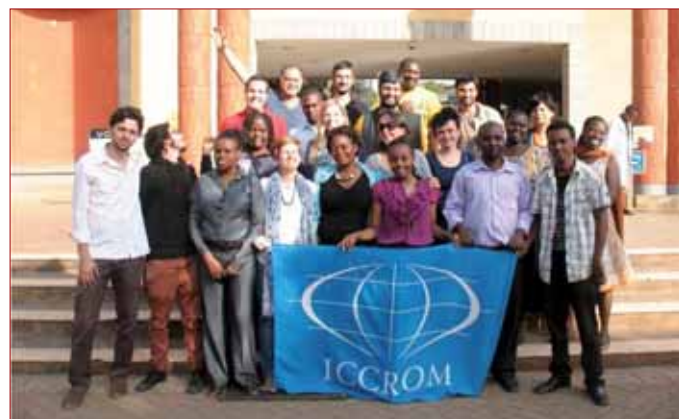
Fig. 16 - One of the last SOIMA 2013 group photo at NMK

essary and appropriate, how to adapt and improve topics to balance the participants’ expectations.