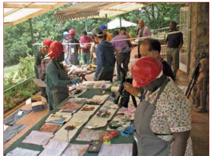
Fig. 12 and 13 - Overviews of the emergency response exercise at TARA