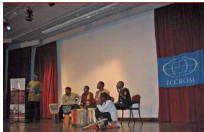
Fig. 2 - Zamaleo Sigana musical group during the SOIMA 2013 opening venue

On the previous night there was a reception dinner at the hotel that was arranged for the participants, teachers and course team.