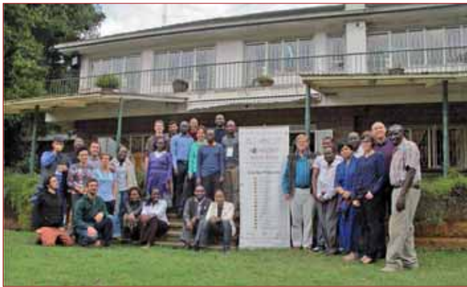
Fig. 3 - SOIMA 2013 group photo at TARA

TARA was the basis of the SOIMA 2013. TARA team attitude was always very welcoming and positive.