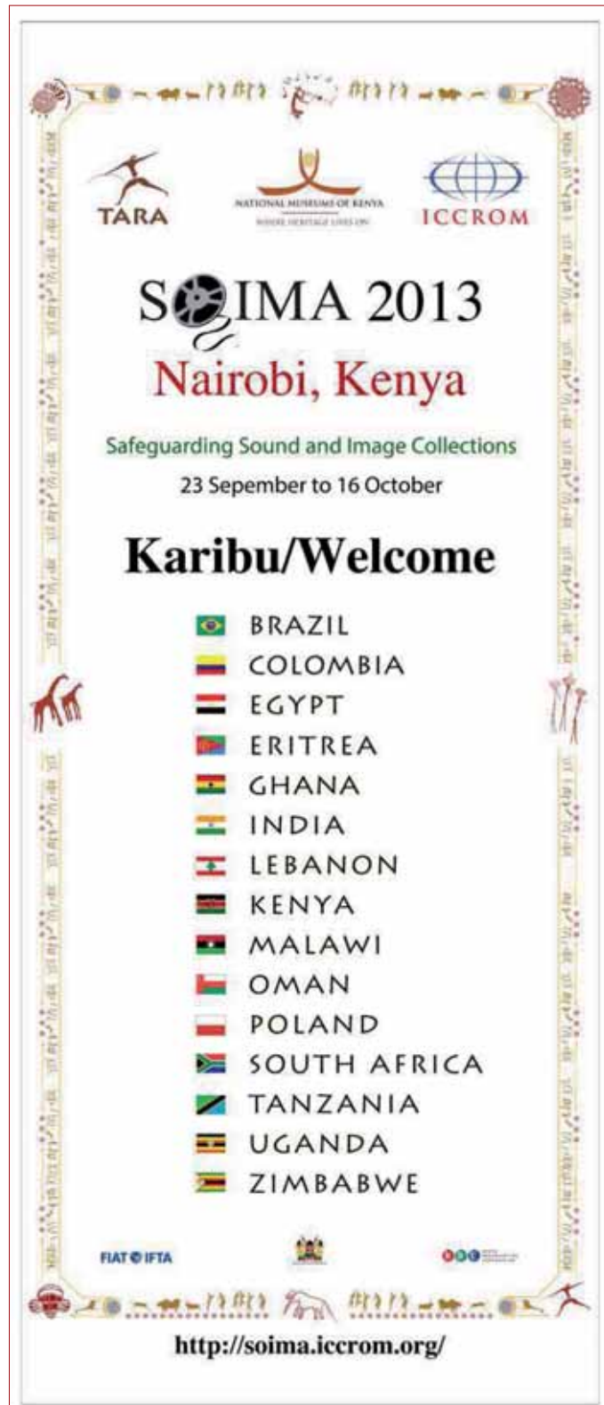
Fig. 1 - SOIMA 2013 banner