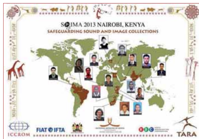
Fig. 6 - SOIMA 2013 map of participants

The SOIMA 2013 course continues to embrace the areas of Photography, Film, Video, Sound